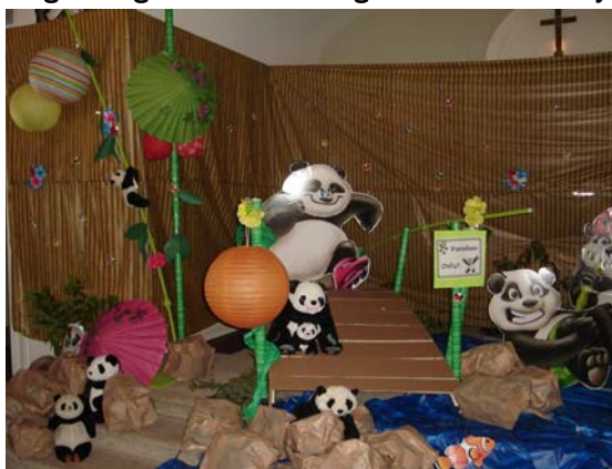
Pandas in the Chapel