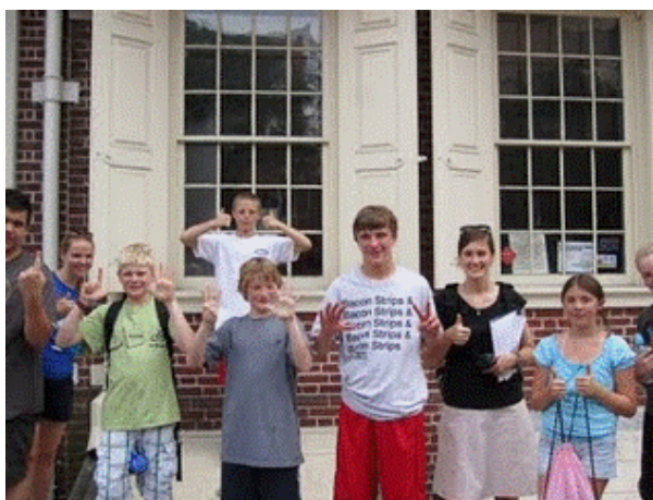
One of the stops in the Philly Scavenger Hunt