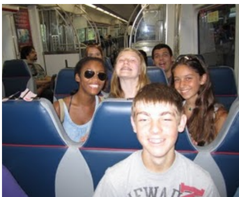
Philly, here we come!!

Our Middle School Youth hit the road this summer and spent some time in Philly for their annual Middle School Mission Trip and attended the Urban Work Camp of the Old First UCC. This year the trip was expanded from three days to five days July 11-15.