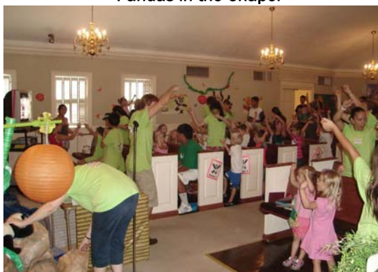
Closing Program Song: God Is Listening!