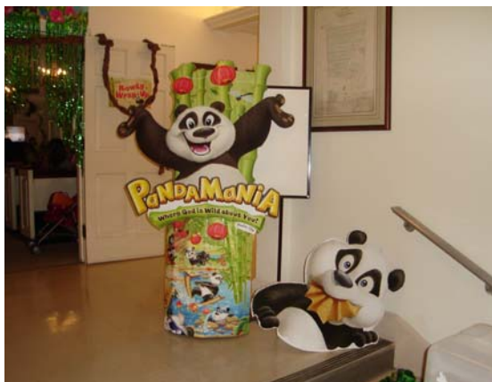
A great big Panda Welcome greeted the kids daily