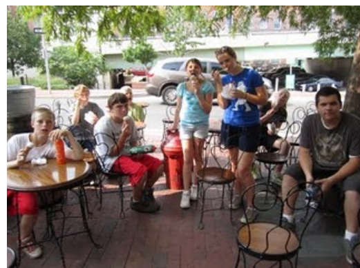
Chillin' with Ice Cream at Franklin Fountain