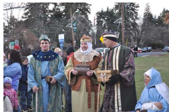
Scenes from Live Nativity 2010

Join us on the front lawn for this annual event.