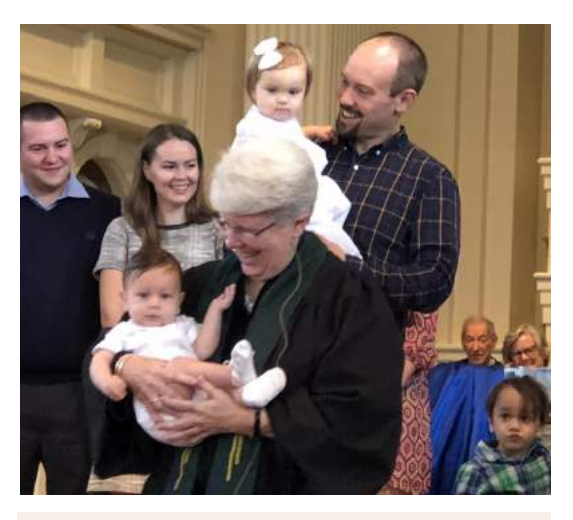
So in Christ Jesus you are all children of God through faith, for all of you who were baptized into Christ have clothed yourselves with Christ.

Parents must attend a Baptism Class as a prerequisite to the baptism. The Baptism classes are held quarterly.